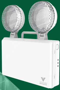
Twinspots 116 Fittings